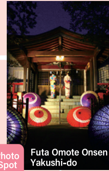
Photo Spot Futa Omote Onsen Yakushi-do