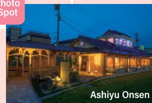
Photo Spot Ashiyu Onsen