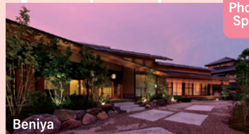
Beniya Please ask a nearby staff member for help when taking pictures.*Not allowed inside the facility.